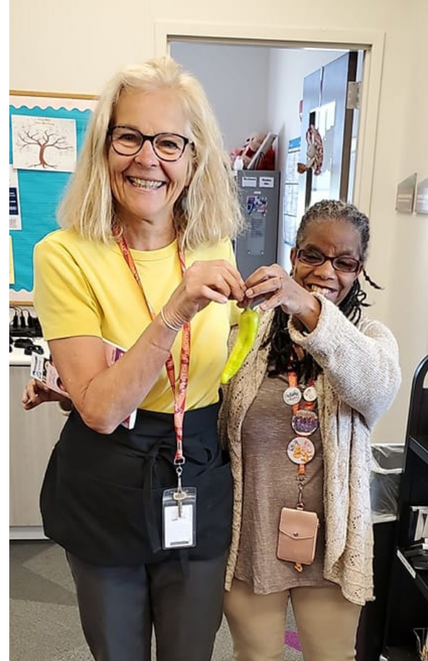
Children's librarian and branch manager posing together with the first harvest from the "Grow with Me" gardening program